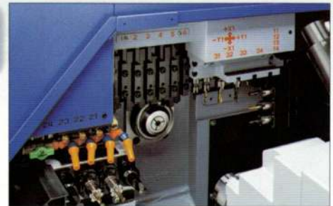
The photo shows a non-guide bush type.

G.B.: Guide bush / N.G.B.: Non-guide bush